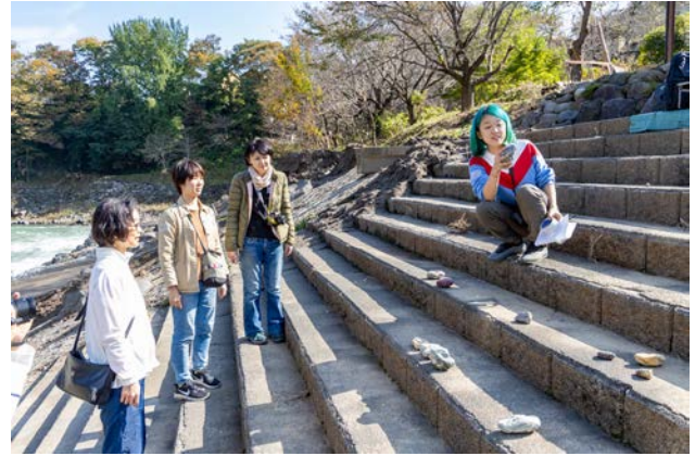
workshop view

“Reality and imagination of surface / Exploring Saruhashi” 2019 A workshop held in Saruhashi area