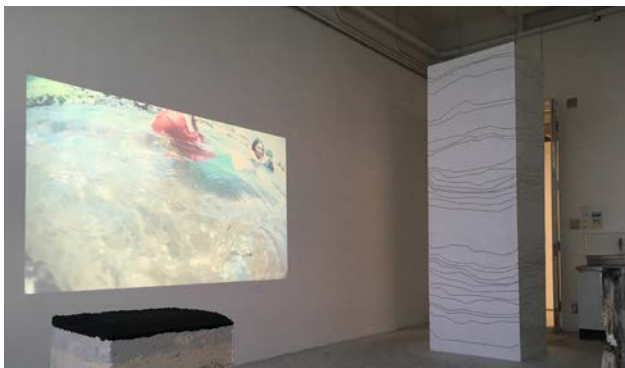
installation view from the view-pointA on the map

Installation cement, video, 2'31, loop, resin, parametric speaker 4218 × 4311 × 8024mm