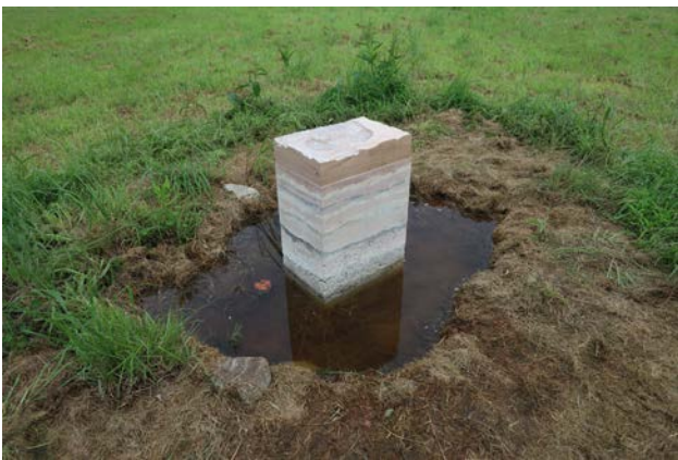
installation view

“It is said that this star was dominated by monkeys with no hair” 2020 Glass, sand stone, concrete 450 × 600 × 900