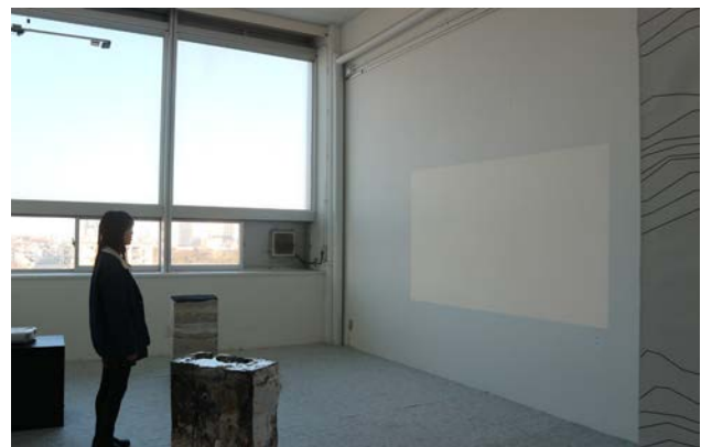
installation view from the view-pointB on the map