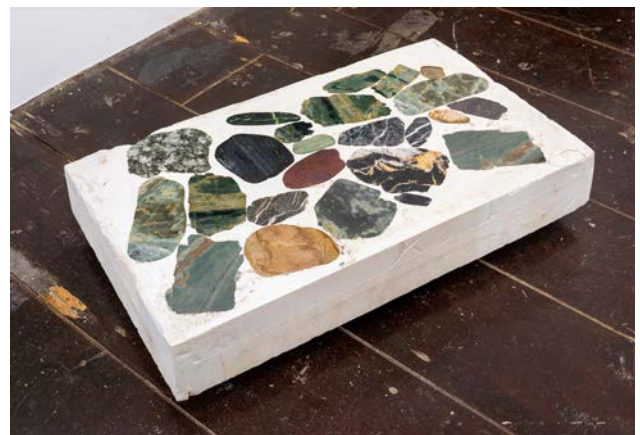
An archive of the workshop

Questions asked while picking up stones: -Write today's nickname using the alphabet -Write the weight of your imagination Condition: Express using measuring units other from grams, pounds, or tons -Write the time of discovery Condition: Express using units other from year, month, day, or minute