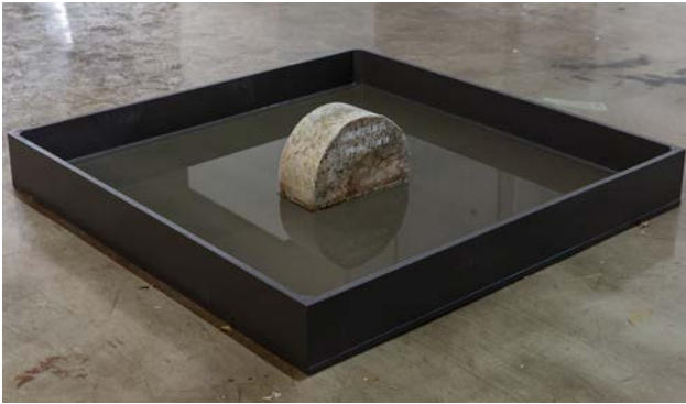
installation view

“Artificial erosion” 2019 Marble, Vinegar, Wood 900 × 900 × 100mm